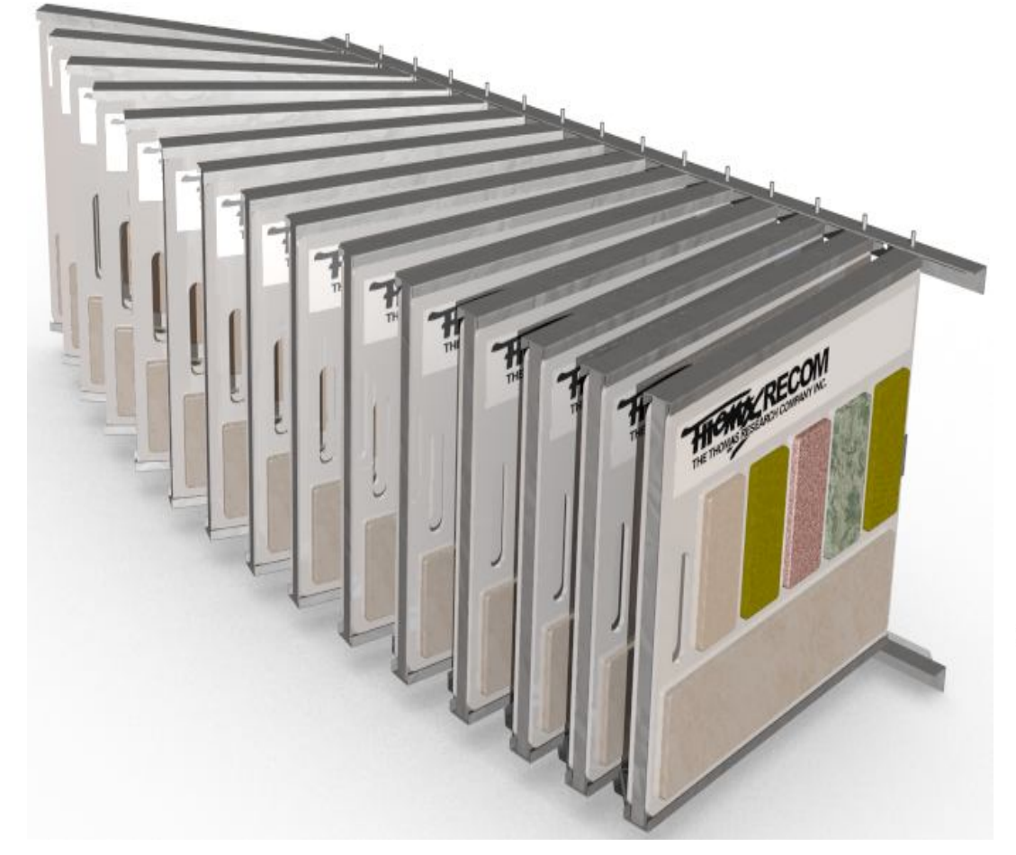
We can custom fabricate the wings with any quantity or size panel

All steel construction, powdercoated black (or your special color at quantity). You choose how many wings and what size boards (we make the boards too). You choose how many boards per wing. Wings are typically spaced 3" apart.