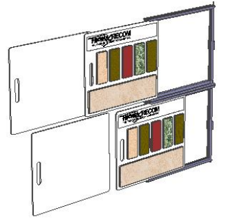
We can custom fabricate the wings with any quantity or size panel